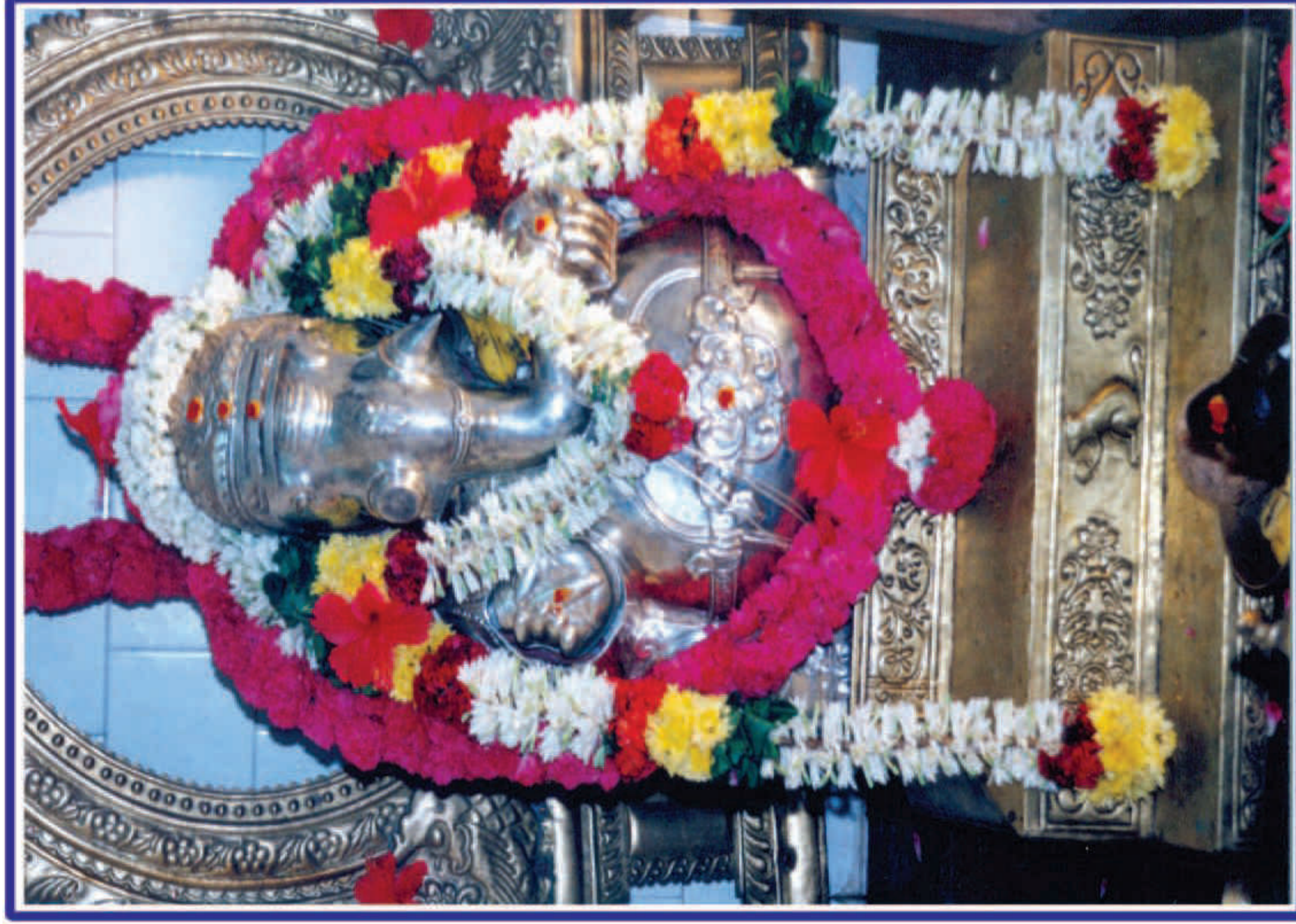
Lord Jaya Vinayagar