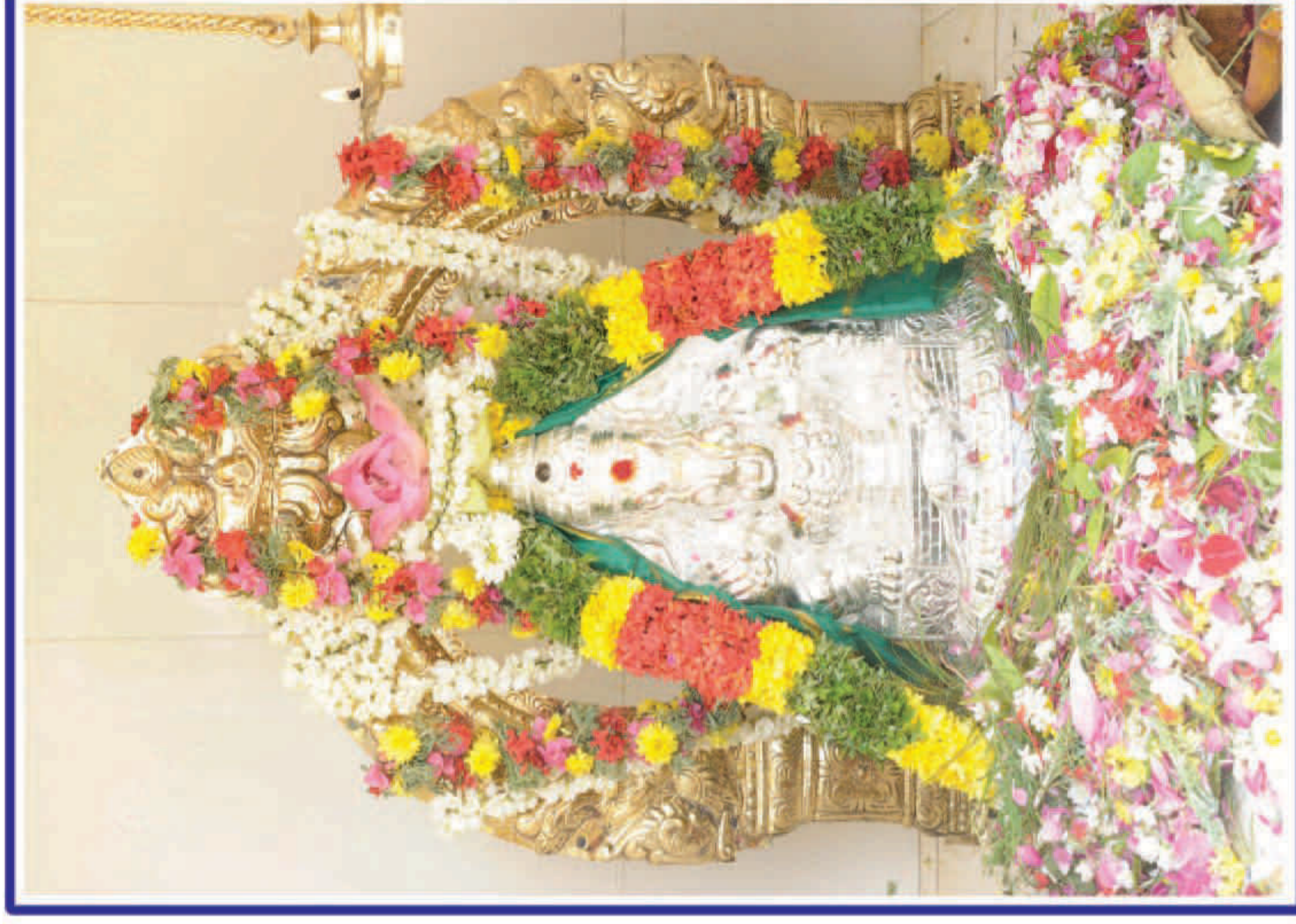
Lord Vidhya Vinayagar