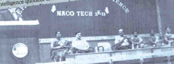
Puuducherry Lieutenant Governor Kiran Bedi delivering the Rajaji Memorial Endowment Lecture at National College in Tiruchi on Thursday.