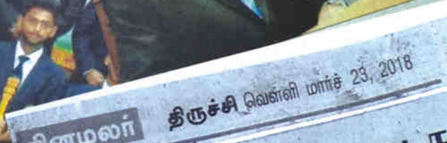
I.L. Ganeshan speaking at a podium during a meeting.