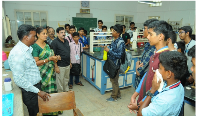
CHEMISTRY - LAB