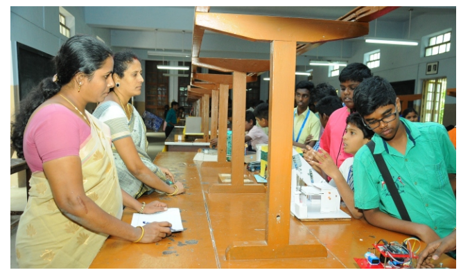
PHYSICS - LAB