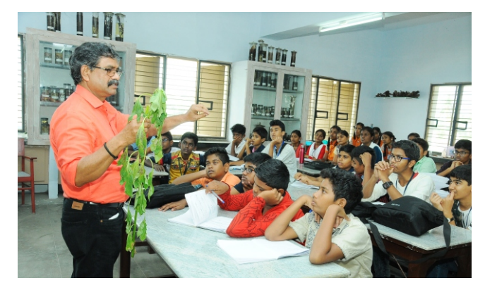
BOTANY - LAB