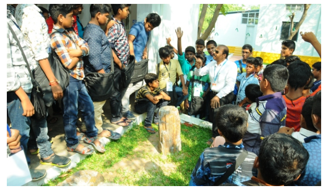
GEOLOGY - LAB