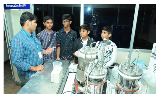
BIOTECHNOLOGY - LAB

Our College faculty members and eminent personalities interacted with the students through lectures in the morning sessions. In the afternoons the student visited different science laboratories and practiced simple experiments.