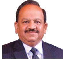
Dr. Harsh Vardhan

Minister for Science & Technology and Earth Sciences